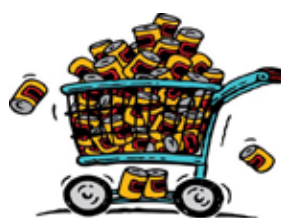
Food Bank Donations