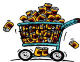
Food Bank Donations