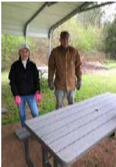
Picnic tables donated by the DOK to the Women in Unity.